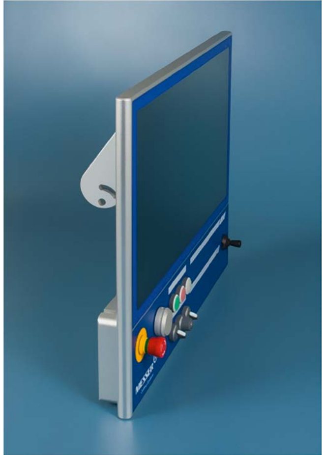
Hardened switches and industrial touchscreen