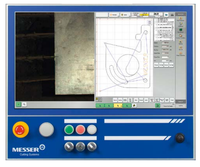
High strength machined aluminium enclosure

Messer Cutting Systems Global Control<sup>Plus</sup> has an easy to use interface and on-board database, allowing for quick set-up and high quality cut parts. An extensive custom shape library, multiple process databases, CAD import, true-shape nesting, productivity monitoring and remote diagnostics features packaged in the industry's only IP65 rated enclosure. Easy to learn functions allow for a quick familiarisation for new employees to achieve expert results.