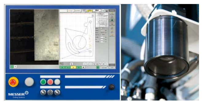
Video camera (right) allows for fast, accurate plate alignment

Cutting parameter database (plasma/oxyfuel) with display of consumables makes process set-up quick and error-free