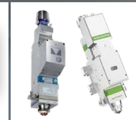
Precitec Cutting Head Raytools Cutting Head