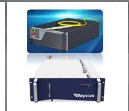
IPG Laser Raycus Laser