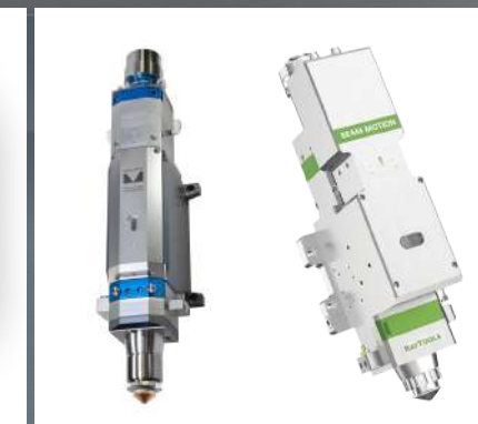
Precitec Cutting Head Raytools Cutting Head