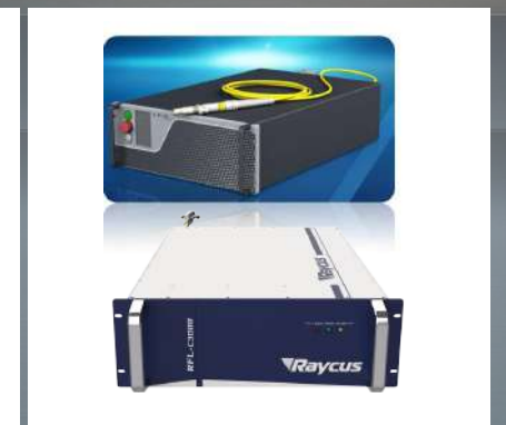
IPG Laser Raycus Laser